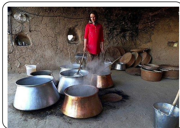
Fig. 1: A woman is preparing grape syrup, in Malayer, Iran.

The most important step in the grape syrup production is the white soil addition as an acid reduction [16]. Because, the used white soil can also add various mineral salts of K, Ca, Mg and Fe to the produced syrup; this can be very harmful to the human body and may cause kidney or liver disease [17]. Furthermore, the body's need for these nutrient elements is limited, and excess amounts